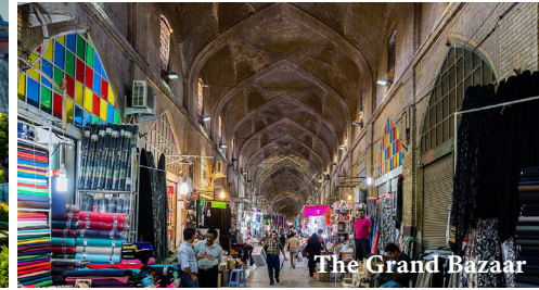
The Grand Bazaar