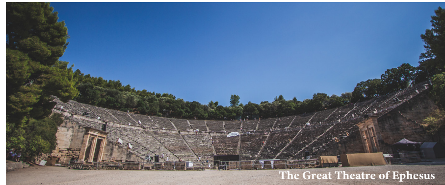
The Great Theatre of Ephesus

the Temple of Adrian, the Celsus Library, and the Grand Theater of Ephesus! We will also visit the house of the Virgin Mary, where she spent her final days. Dinner and overnight accommodation will be at your hotel.