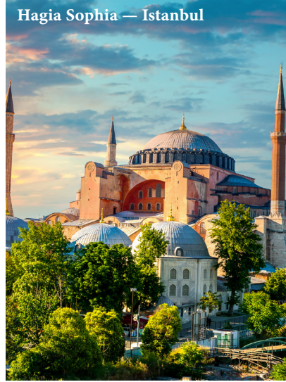
Hagia Sophia — Istanbul